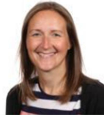
Hannah Place 5A Cover Wed am / PPA Cover 5A & 5H Wed pm