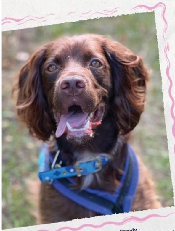
Brandy - Burford rehoming centre

Join our Paws to Draw competition for all ages and help raise awareness of homeless pets