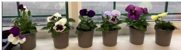
Start of the experiment:

YEAR 3 and 4 have been enjoying their 'plants' topic this week, where they placed flowers in different environments around school to see what they needed to live and grow! These are the before and after photos -