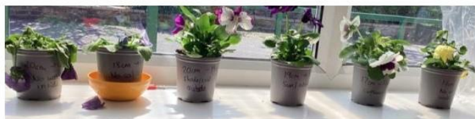
After one week: