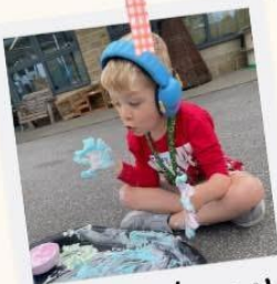
Arts and crafts